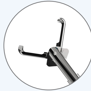
Foreign Body Grasper