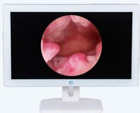
Image Processor for video, light and image capture